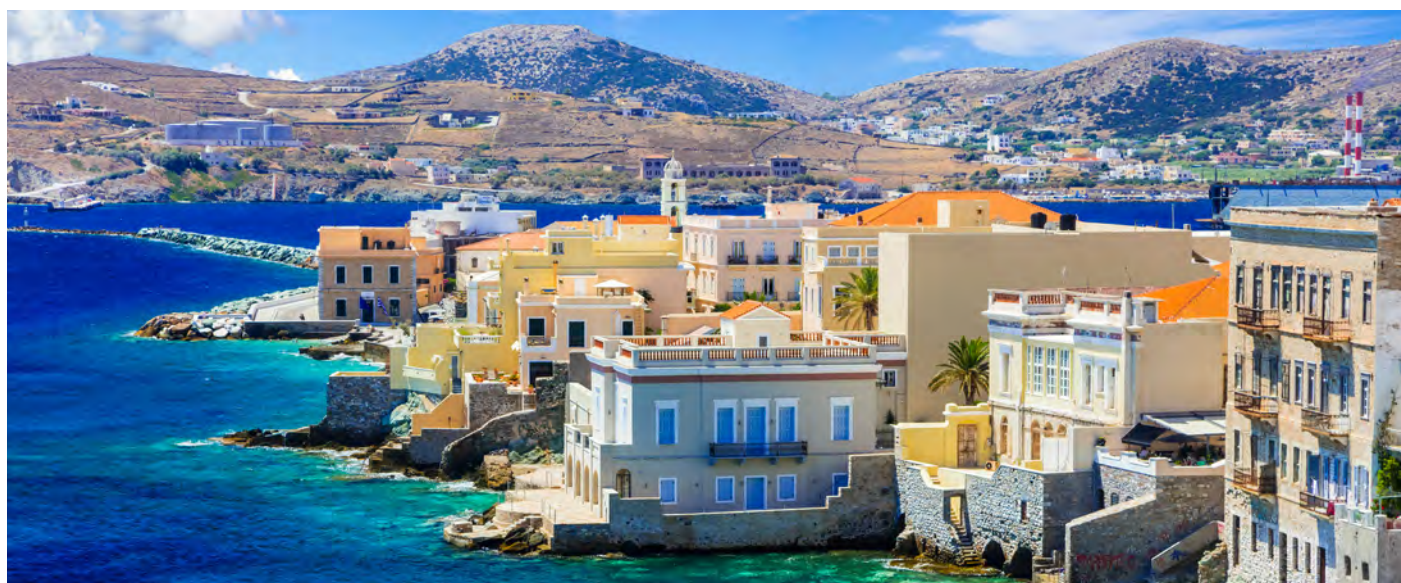
Heraklion harbour with old Venetian Fort Koule, Crete, Greece

Silversea is delighted to announce its return to service from 18 th June 2021. Be among the first to enjoy our new voyages on one of the most spacious ships in our fleet. Sail the beautiful Greek islands on bespoke itineraries that offer the best of a region, aboard our newest flagship Silver Moon . Plus, with two alternative sailing routes, each visiting different destinations, you have the option to combine voyages for extended exploration. From sun kissed beaches to UNESCO World Heritage Sites, we have conceived this collection of cruises with all safety measures in mind. Get back to the discovering the authentic beauty of the world in unwavering confidence.