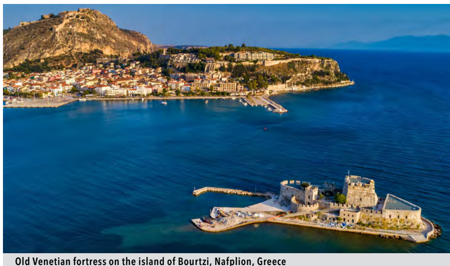
Old Venetian fortress on the island of Bourtzi, Nafplion, Greece