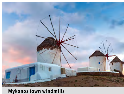
Mykonos town windmills