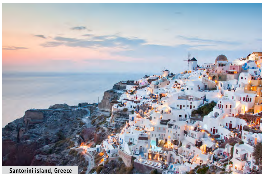
Santorini island, Greece