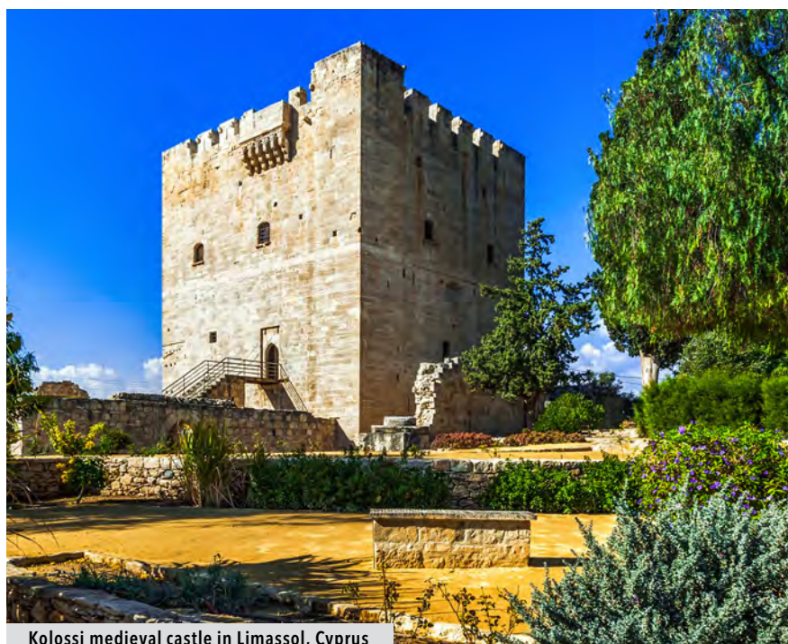
Kolossi medieval castle in Limassol, Cyprus