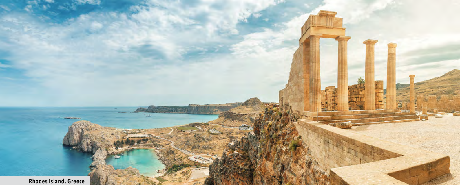
Rhodes island, Greece

Silversea is delighted to announce its return to service from 18 th June 2021. Be among the first to enjoy our new voyages on one of the most spacious ships in our fleet. Sail the beautiful Greek islands on bespoke itineraries that offer the best of a region, aboard our newest flagship Silver Moon . Plus, with two alternative sailing routes, each visiting different destinations, you have the option to combine voyages for extended exploration. From sun kissed beaches to UNESCO World Heritage Sites, we have conceived this collection of cruises with all safety measures in mind. Get back to the discovering the authentic beauty of the world in unwavering confidence.