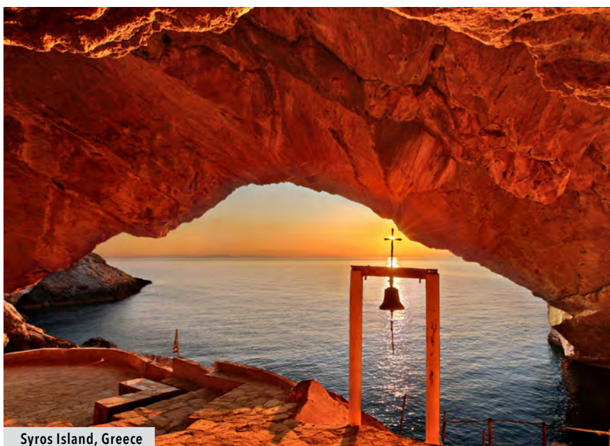
Syros Island, Greece