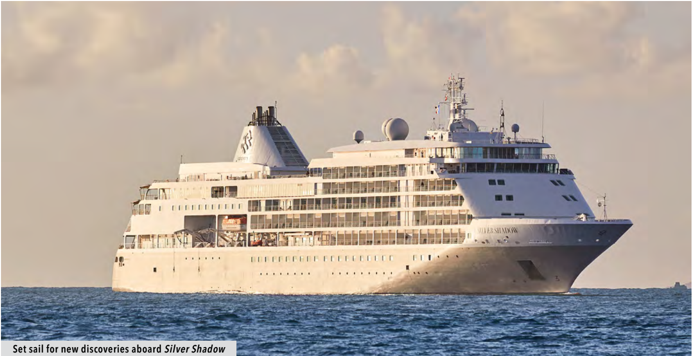
Set sail for new discoveries aboard Silver Shadow

Discover Iceland's rugged landscapes in the utmost safety and supreme style aboard the recently refurbished Silver Shadow . Personalised butler service and multiple dining choices offer an inviting return to sailing, along with all-suite accommodations and one of the highest space-to-guest ratios at sea. Silver Shadow's small size also affords exclusive access to narrow fjords and remote locales, serving as the ideal launch point for intimate, ultra-luxury adventure in Iceland.