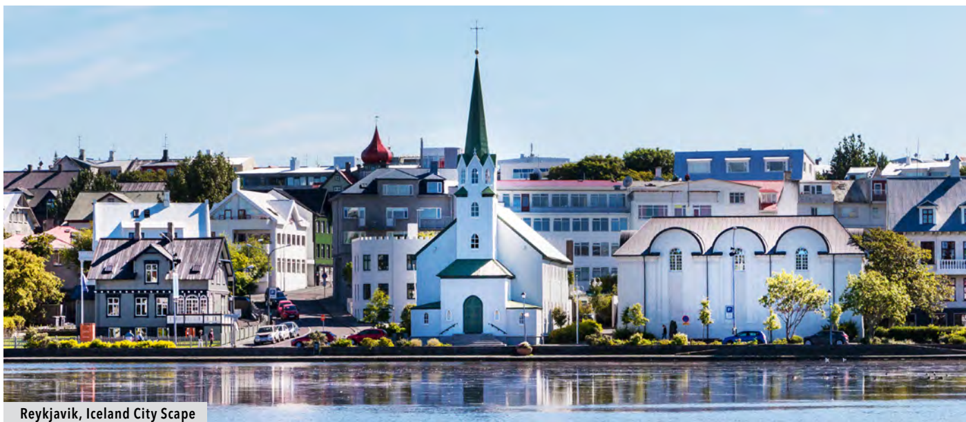
Reykjavik, Iceland City Scape

Silversea is thrilled to announce our highly anticipated return to sailing with a collection of new Iceland voyages aboard Silver Shadow starting 30 July 2021. This is a chance to experience the land of fire and ice in unparalleled comfort aboard Silver Shadow , one of the most spacious ultra-luxury ships at sea. Our roundtrip Reykjavik itineraries reveal the unspoilt magic of a country defined by massive glaciers, soaring volcanoes, and Viking history. Late departures inspire guests to make the most of long summer days, with deep exploration in epic destinations including Akureyri and Seydisfjordur. Guests will be awed as Iceland's natural wonders shine brilliantly under the midnight sun.